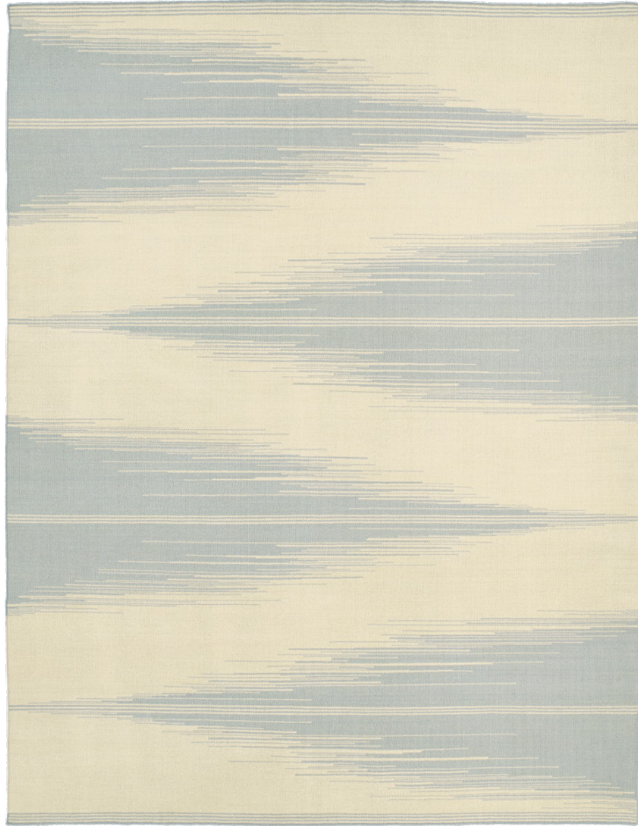
Kelim Pattern Cape 0063