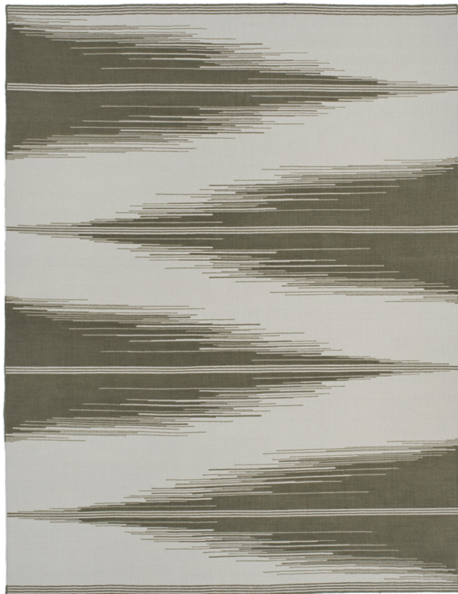
Kelim Pattern Cape 0074